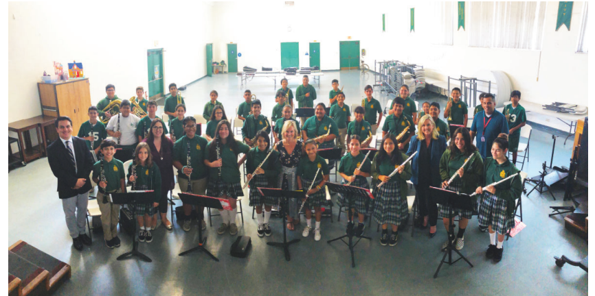
Marian Alliance Band at St. Joseph Catholic School in Santa Ana.