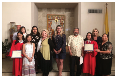
The Fred V. Duda Scholarship Fund supports students from St. Justin Martyr Catholic School. Photo taken before pandemic.

Those who came before us have built up a strong, vibrant network of Catholic schools. To ensure that these schools continue to thrive, we are announcing the launch of a new Orange Catholic Schools Fund. This fund, managed by the Orange Catholic Foundation, will offer donors the opportunity to support the many immediate and long-term needs of our local Catholic schools and the students they serve.